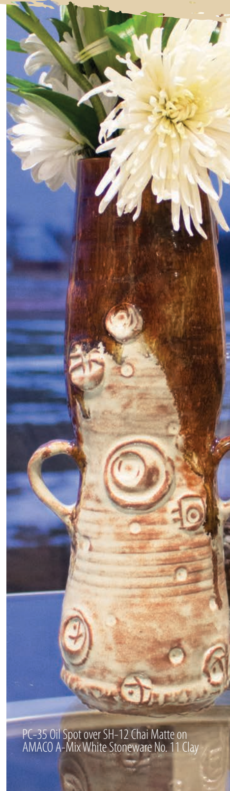
PC-35 Oil Spot over SH-12 Chai Matte on AMACO A-Mix White Stoneware No. 11 Clay

Join the conversation www.facebook.com/groups/potterschoiceex